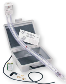
1212 gas pressure kit