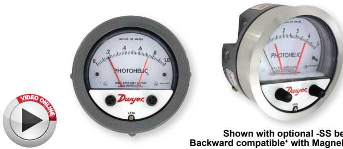
Shown with optional -SS bezel Backward compatible* with Magnehelic® gage